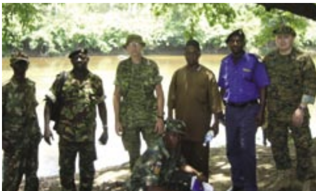
At the SL / Guinea border. Guinea can be seen across the river.