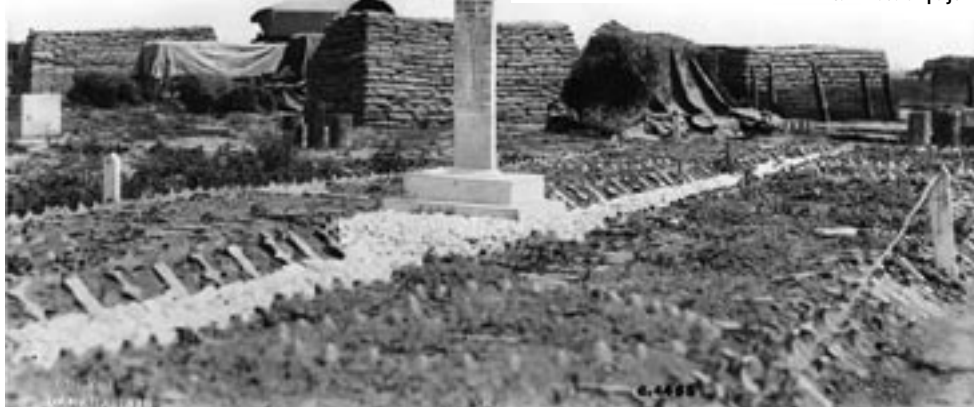
Cross erected on Vimy Ridge battlefield the night of 11/12 April 1917