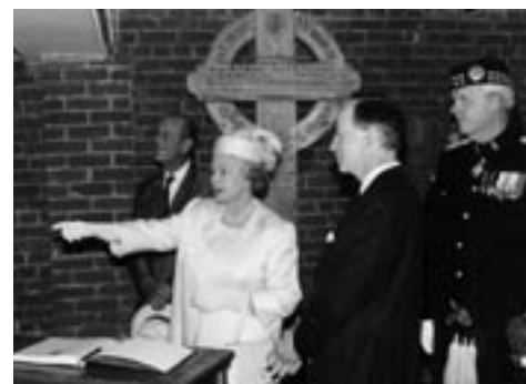
Her Majesty with HLCol Beal in front of Vimy Cross in 48th Highlanders Museum.

moved to the cross on which 57 names were painted in black on the white background. Twenty three of these names had been placed on the cross on the evening it was erected with the others added subsequently of Highlanders who died of their wounds. There on the lower section of the cross was "C A Jensen 803138. To those in the room it felt as if a 48th Highlander was home.