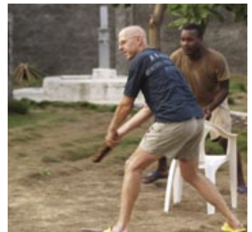
Playing cricket – its funny what you do when you're away from home!