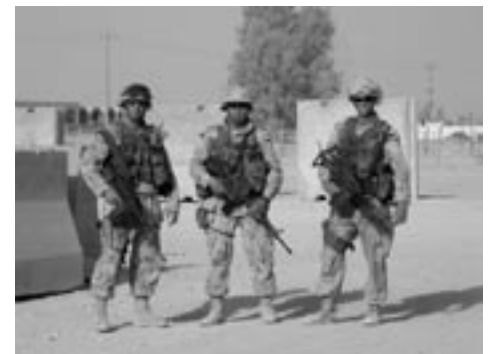
Highlanders on operational duty in Kandahar.

I have recently returned from Afghanistan and I was asked to write about my experiences. I was attached to the NCE security Platoon as a Section Commander and was responsible for manning the main gate at Kandahar Airfield. Within my section, I had two other fellow Highlanders under my command who I am happy to report did an excellent job. Along with us, there were ten other presently serving or former Highlanders in many positions. Some of these included CIMIC (civil military cooperation), PAFFO (public affairs officer), and the force protection platoon. Others have decided to make the military their full time career in both 1 RCR and 2 PPCLI.