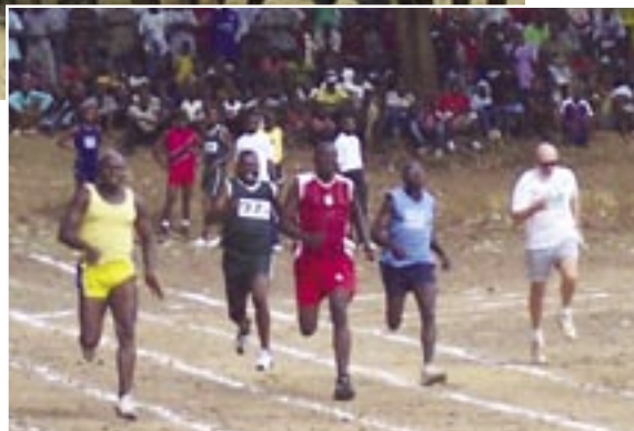
The RSM's 100m Sprint – this was as close as it got!